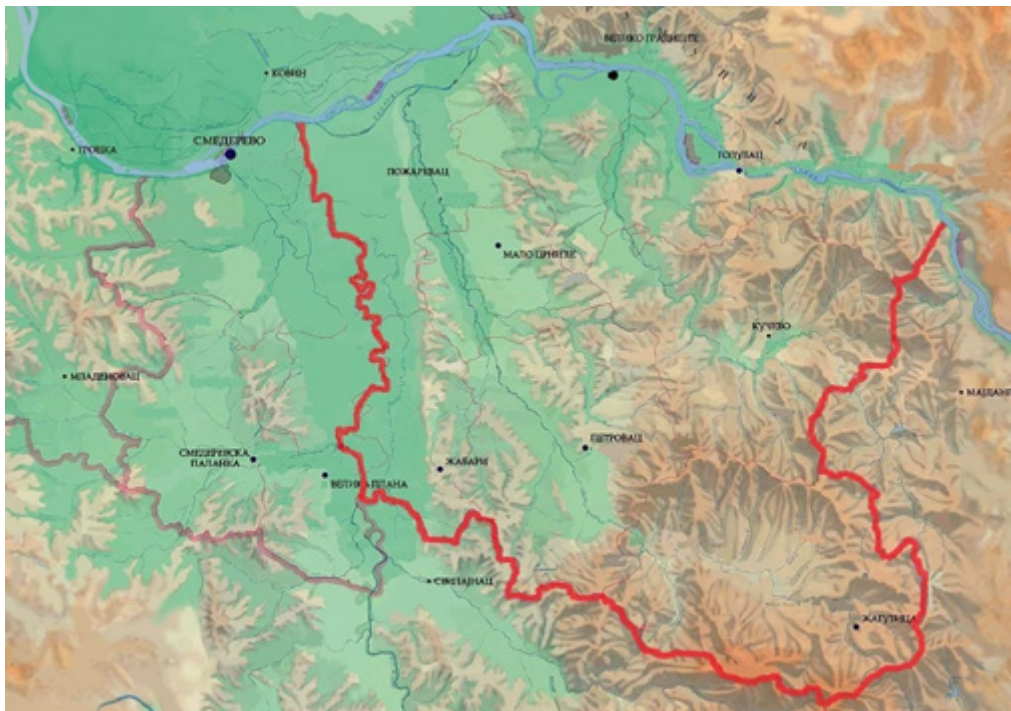
Map 1 - The Braničevo District [6]. Scale 1: 366,000

The Braničevo District occupies 4.37% of the total territory of the Republic of Serbia. It covers 8 municipalities: Požarevac, Veliko Gradište, Golubac, Petrovac-on-Mlava, Žagubica, Kučevo, Žabari and Malo Crniće [5]. Through the data analysis it can be concluded that the Braničevo District has a very favorable geographical and tourism position, which is reflected in: the vicinity of the main administrative center of Belgrade, good traffic connections with all major city centers, vicinity of the main roads connected with the south of Serbia and Mediterranean, favorable importance of the Danube navigability and the vicinity of Vojvodina and Romania.