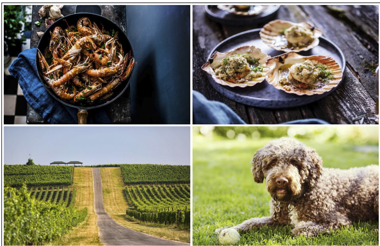
Figure 7. Representation of gastronomy on the CNTB website: section Croatia feeds

Finally, the last section of the website is dedicated to a special project that CNTB is doing. One of these is Croatia feeds , representing the only example of the inclusion of food and wine in the project. If examined a bit deeper, wine again has very little attention, apart from the vineyards portrayed from the bird's perspective, there is no deeper connection to wine as a culture or tradition. Food is in this case more represented than in any other place on the webpage, as evident in Figure 7.