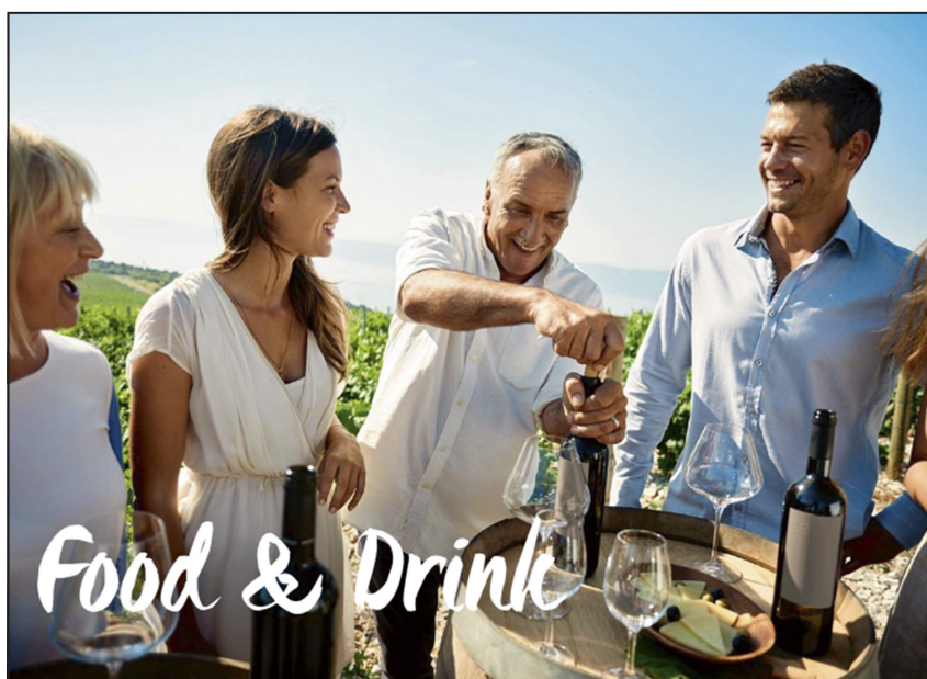
Figure 6. Representation of gastronomy on the official CNTB website

The next section is what to do? , where the same image that was used before again represents gastronomy tourism accompanied by the text “...savor unforgettable dishes”, as seen in Figure 6 below. There is also a section that leads to further research, which then leads to (under the section food & drink ) further expiration of Croatian food and wine. It is interesting that, despite the focus solely on wine, the word that is used instead of wine is drink . To reach this section, visitors need to spend quite a lot of time trying to find it on the website.